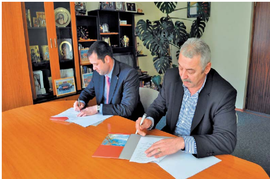
^ Signing of the Memorandum of Understanding between RDA North, Republic of Moldova and RDA NORTH_EAST, Romania

a sustainable and successful collaboration between the RDA North, Moldova and RDA North-East, Romania.