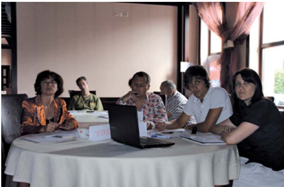
^ The representatives of Moldova at the training course in Iasi, Romania