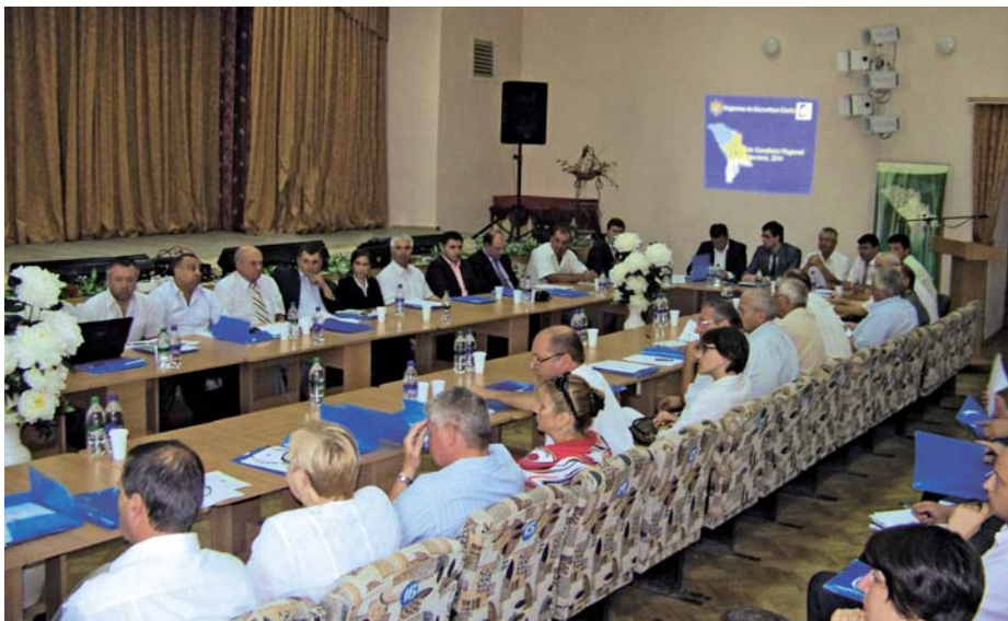
^ Meeting of RDC Center with the new members

During the first meeting of the newly comprised RDCs, the chairmen and deputy chairmen of the councils were elected. Private sector representatives were also appointed in NCCRD from each of the three regions.