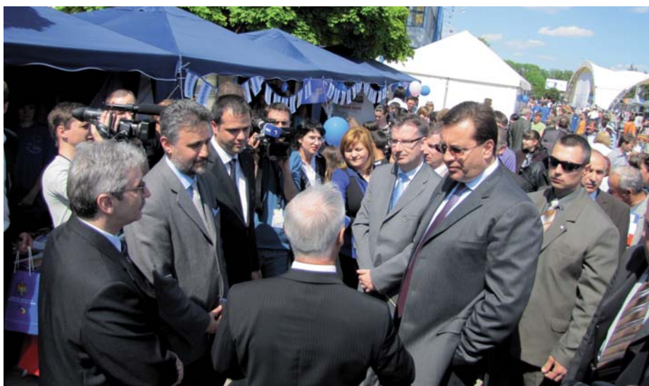
^ Europe's Day in Balti

In connection with Europe's Day, during two weeks in May, the MRDC, in collaboration with RDSs North, Center and South, organized a series of events dedicated to this holiday. On this occasion the Open Doors Day was organized in all RDAs. In Balti, a students' conference dedicated to Europe Day was held and a roundtable covering the topic: "Investment opportunities in DR North of Moldova for Romania and other EU countries" was organized.