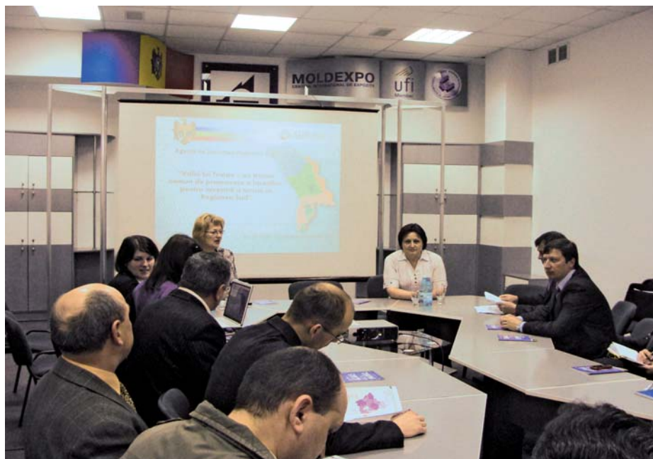
^ Roundtable at Moldexpo where the regions' tourism potential was presented

that promote tourism. The event was organized in collaboration with ANTREC and with participation of the National Tourism Agency.