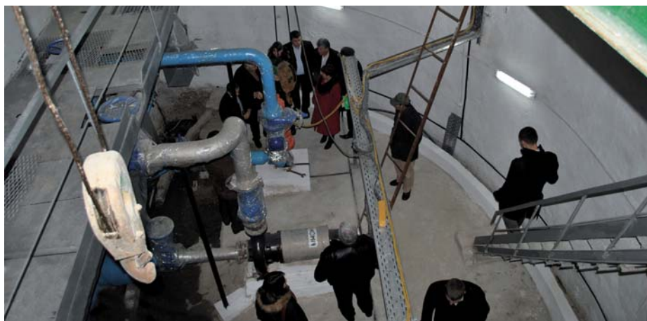
^ Visit to the water treatment plant, Călărași

sessions were developed to meet the needs of the employees, in addition to the training sessions included in the Annual Training Plan for 2011,