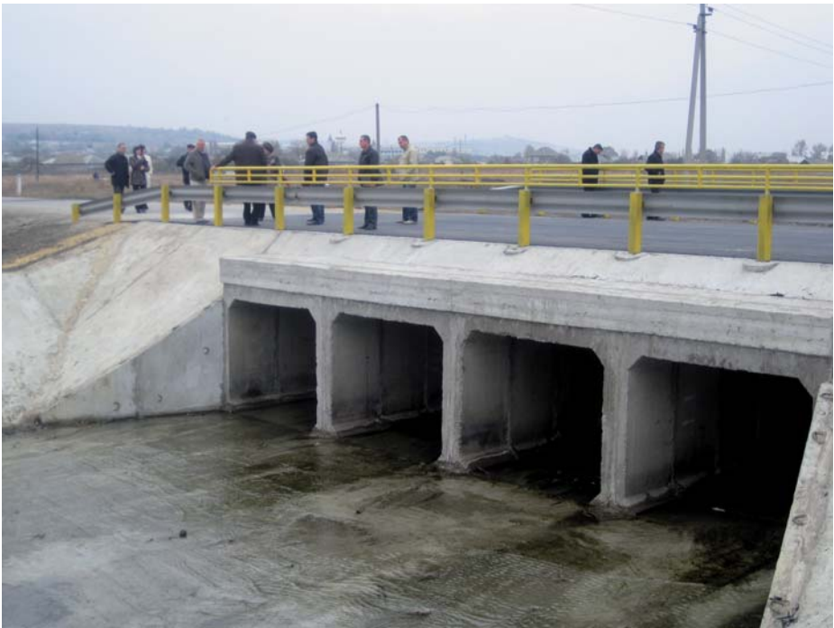
▼ Bridge over Cogilnic

The degree of NFRD sources use for regional development projects is presented in Appendix 2.