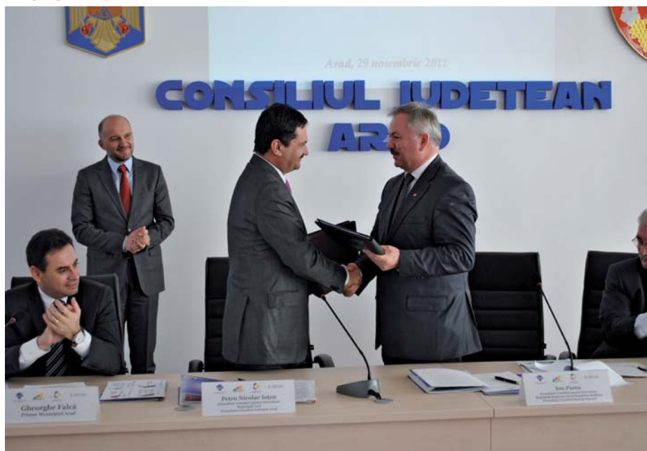
v Signing the Cooperation Protocol between DR North, Moldova and DR West, Romania

During the visit, the representatives of the RDA North, Moldova participated in a two-day training program, which covered the main stages of project management. The gained experience will be applied in the implementation of regional projects.